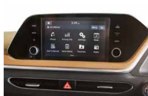
8" Floating infotainment system display