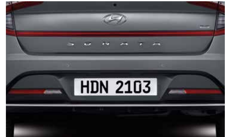
Sporty rear bumper/Rear parking sensors/Rear camera