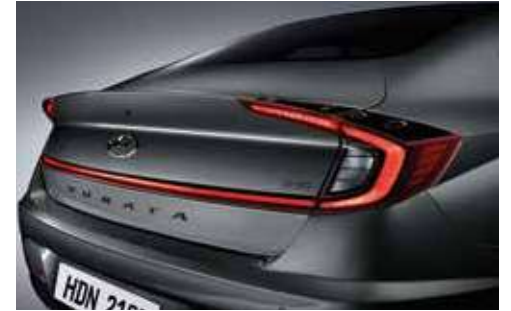
Horizontal LED Rear Tail lights with LED turn signal lamps