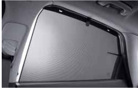
Rear window curtain