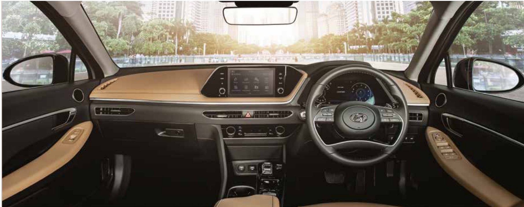
Camel two-tone interior