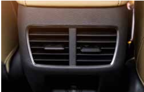
Rear AC vents