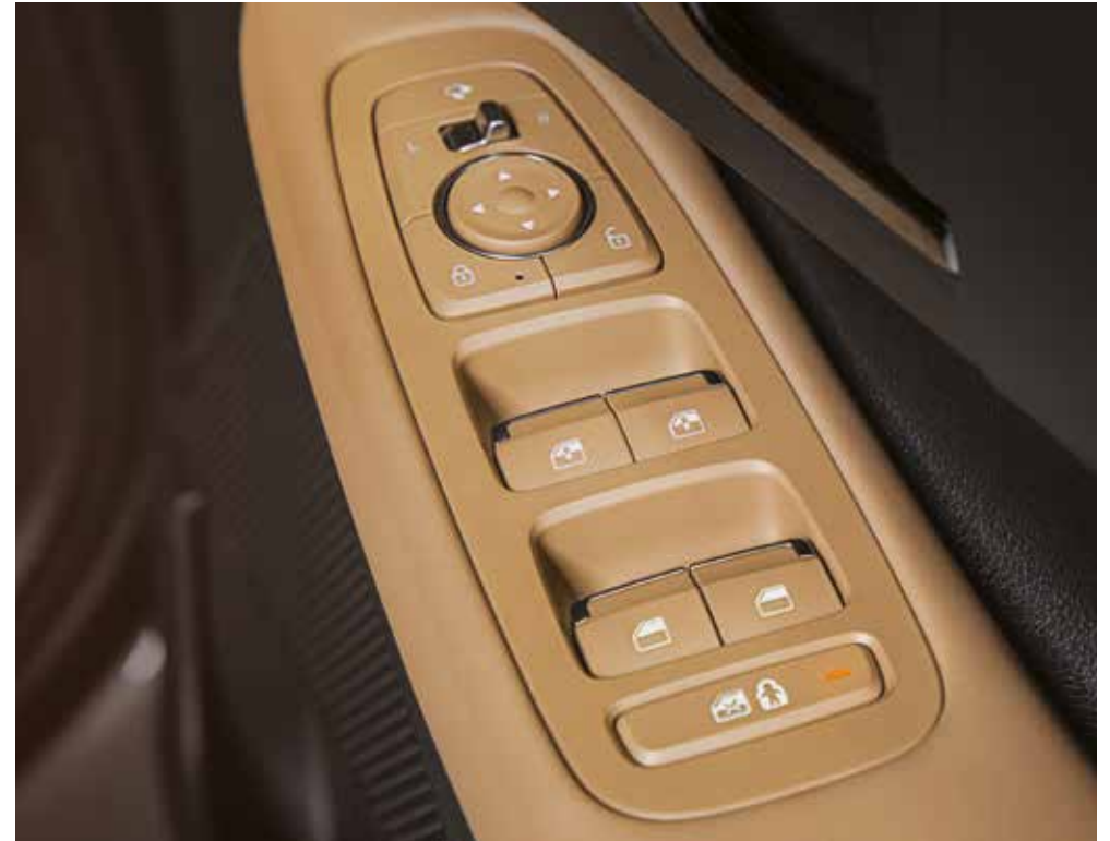
Auto child lock