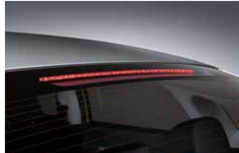
LED high mount stop lamp