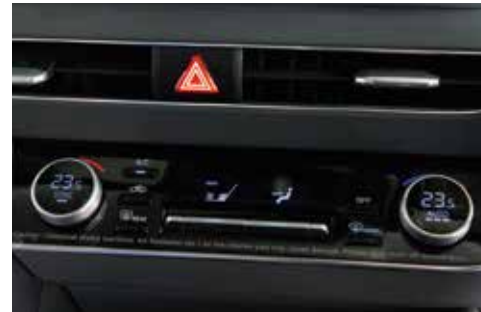
Dual zone automatic climate control