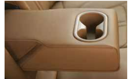
Arm rest (rear seats)