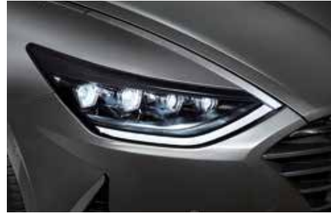
LED headlamps (Projection type)/Daytime running light (LED)