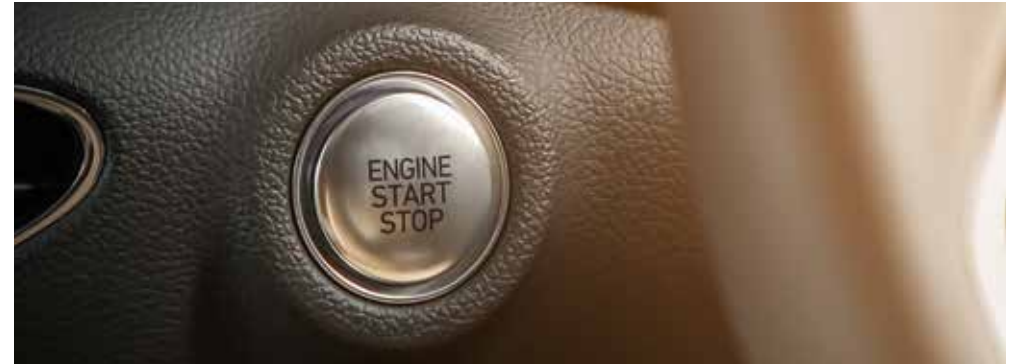
Push start button

Lost or misplaced recharging cords? The cord is a thing of the past with the wireless smartphone charging system that ensures your phone will never go dead.