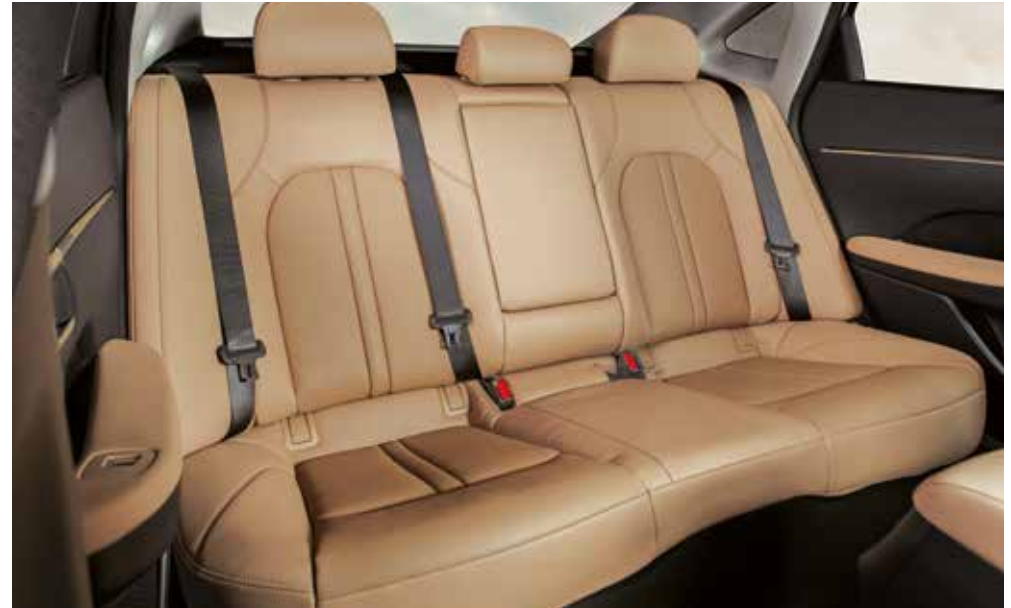
Rear seat with armrest