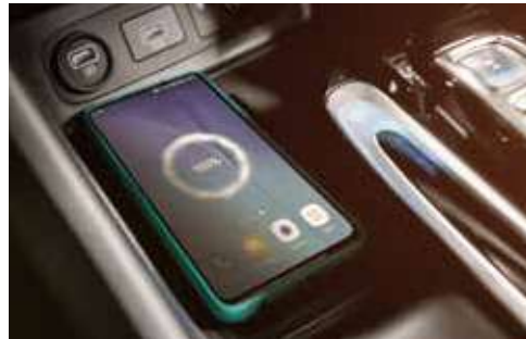
Wireless smartphone charging system