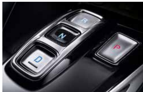
Shift-by-wire 6-Speed automatic transmission