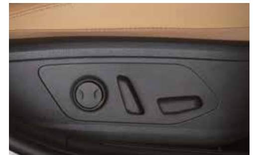
Driver's 10-way powered Seat + 4 way powered Passenger Seat