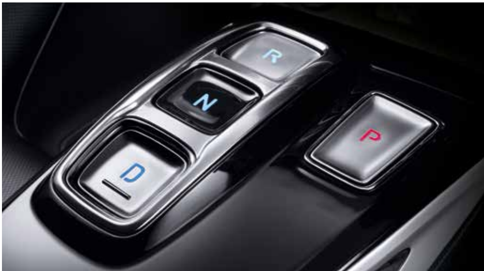
Shift-by-wire automatic transmission

180 Maximum Power ps/6,000 rpm 232 Maximum Torque nm/4,000 rpm