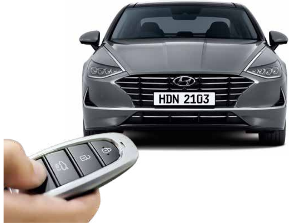
Remote engine start

The SuperVision cluster seamlessly integrates an expanded array of information presented in clear, concise and colorful graphics. By automatic adjustment of the transmission shift schedule, the integrated driving mode offers the driver a choice of five types of drive settings to suit drive preference, each displayed in its own specific color.