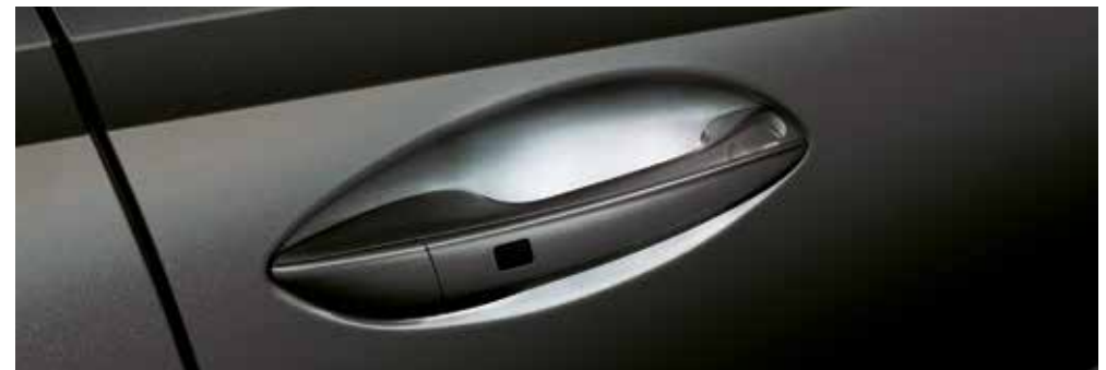
Smart door handle with welcome light