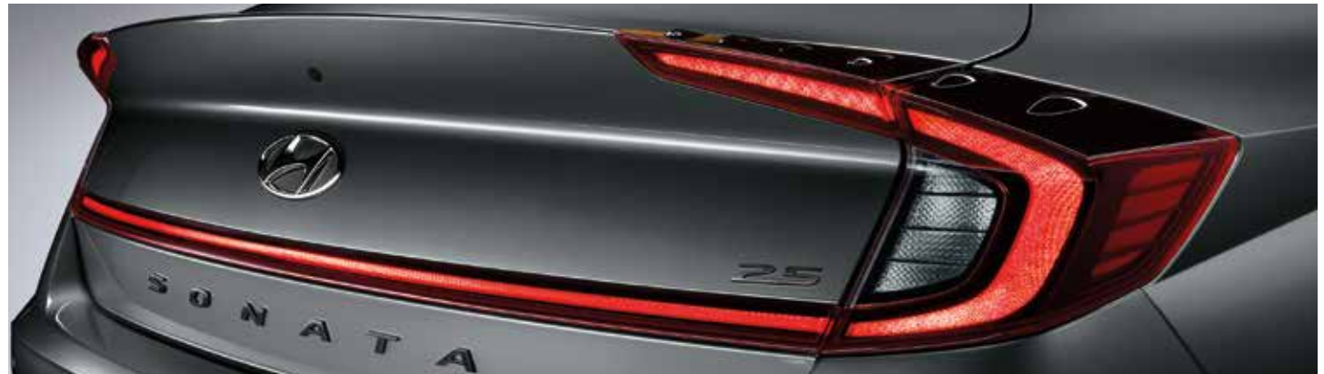
Horizontal LED rear combination tail lights

The design cues continue towards the rear. The connected LED Rear lamps are incorporated with rear air fins which create a unique style and enhance aerodynamic performance. The rear bumper design and extended LED lights provide a broad stance, giving Sonata its perfect blend of sporty and classy look. Rear parking sensors, smart trunk opener and rear LED fog lamps further provide the driver convenience on journeys long and short.