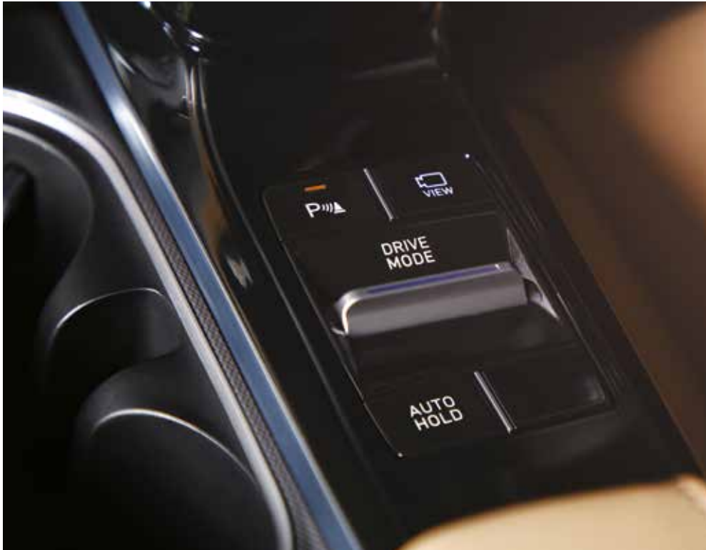
Auto brake hold

A road mishap may not be on your radar, but Hyundai Sonata is best-in-class when it comes to your safety. All geared up with Auto Brake Hold, Electronic Parking Brake, Electronic Stability Control, Hill-Start Assist, ISOFIX Child Seat Anchors and 6 Front and Rear Airbag System. Sonata's top-notch safety technology loves and protects you like family.