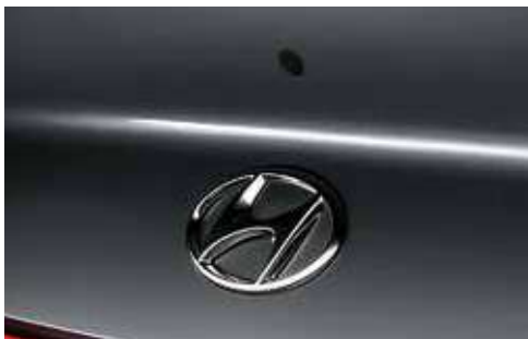
Rear camera and concealed boot lid button