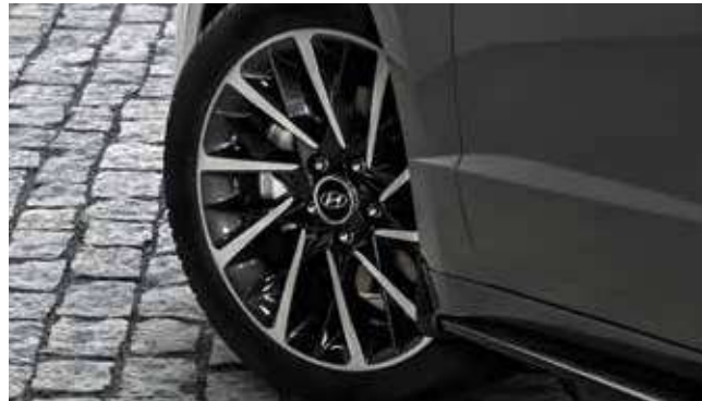
18 inch Alloy wheels