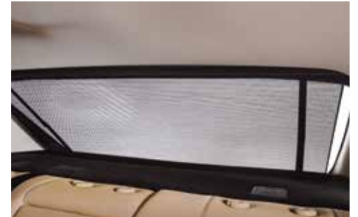
Powered rear curtain