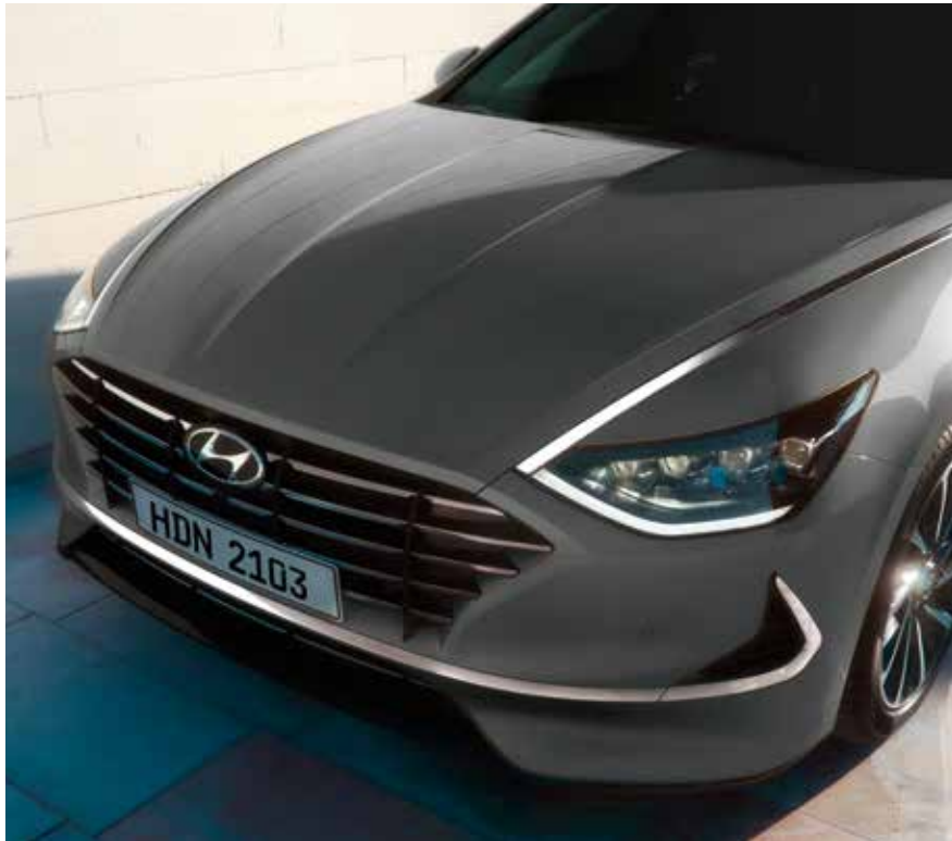
Radiator grille/LED daytime running lights (DRL)/LED Projection headlamps/front parking sensors

Sonata's high style not just sparks the emotions but also delivers high rewards with innovative design features like the gradient hidden light technology, a sure conversation starter that adds to Sonata's mystique. Sonata's high-tech image is reinforced with LED rear combination lamps and available full-LED front lighting. For a statement that expresses high performance, Hyundai offers an 18-inch alloy wheel package and premium Pirelli tires.