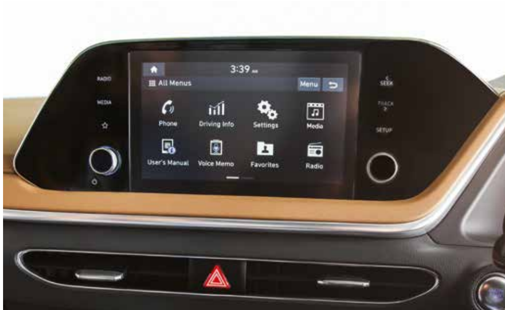
8" floating infotainment system display

Sonata has a way of becoming a part of you, an extension of your body. Its seats cradle you while gauges, control knobs and pedals align perfectly with eyes, hands and feet for a sense of complete confidence and total control. The floating infotainment display offers you latest features and connectivity, while you nestle comfortably in the Leather upholstered luxury seats.