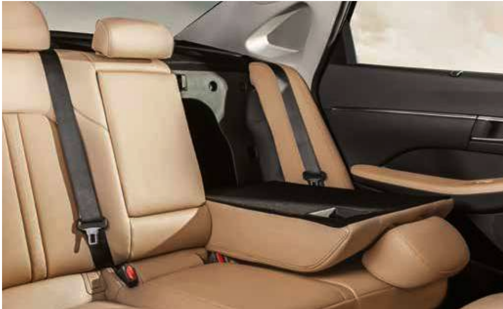
60:40 split folding seats

Sonata takes equally good care of its passengers with seats that bolster and support the spine's natural S-curve so you can really feel the difference that good design makes. The relaxation comfort seat allows the front passenger to unwind by replicating the spinal support of a reclining chaise lounge to achieve a feeling of near weightlessness.