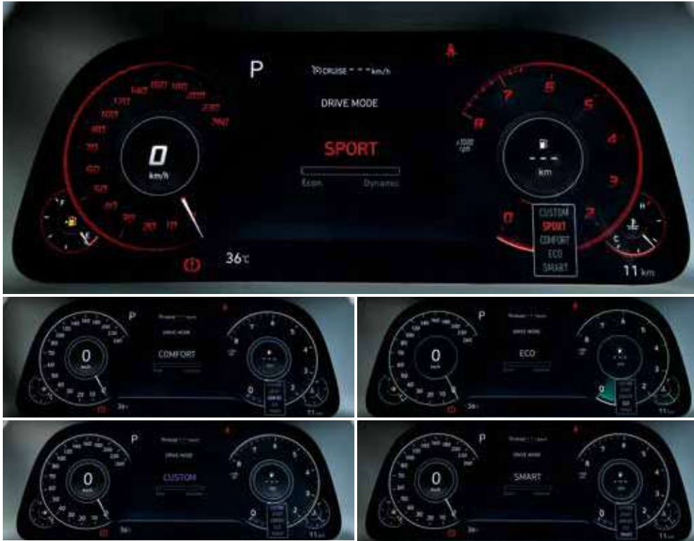
12.3 inch full LCD cluster/Integrated driving mode (Comfort/Smart/Eco/Sport/Custom)

Step inside and discover an interior that engages and satisfies all the senses. The cabin is a visual feast projecting elegance and warmth while delivering a rich tactile experience. The dials of the SuperVision cluster come to life with stunning clarity and show impressive depth. Numbers and batons are crisp and clean with the gauges scoring big points for their elegance and functional simplicity.