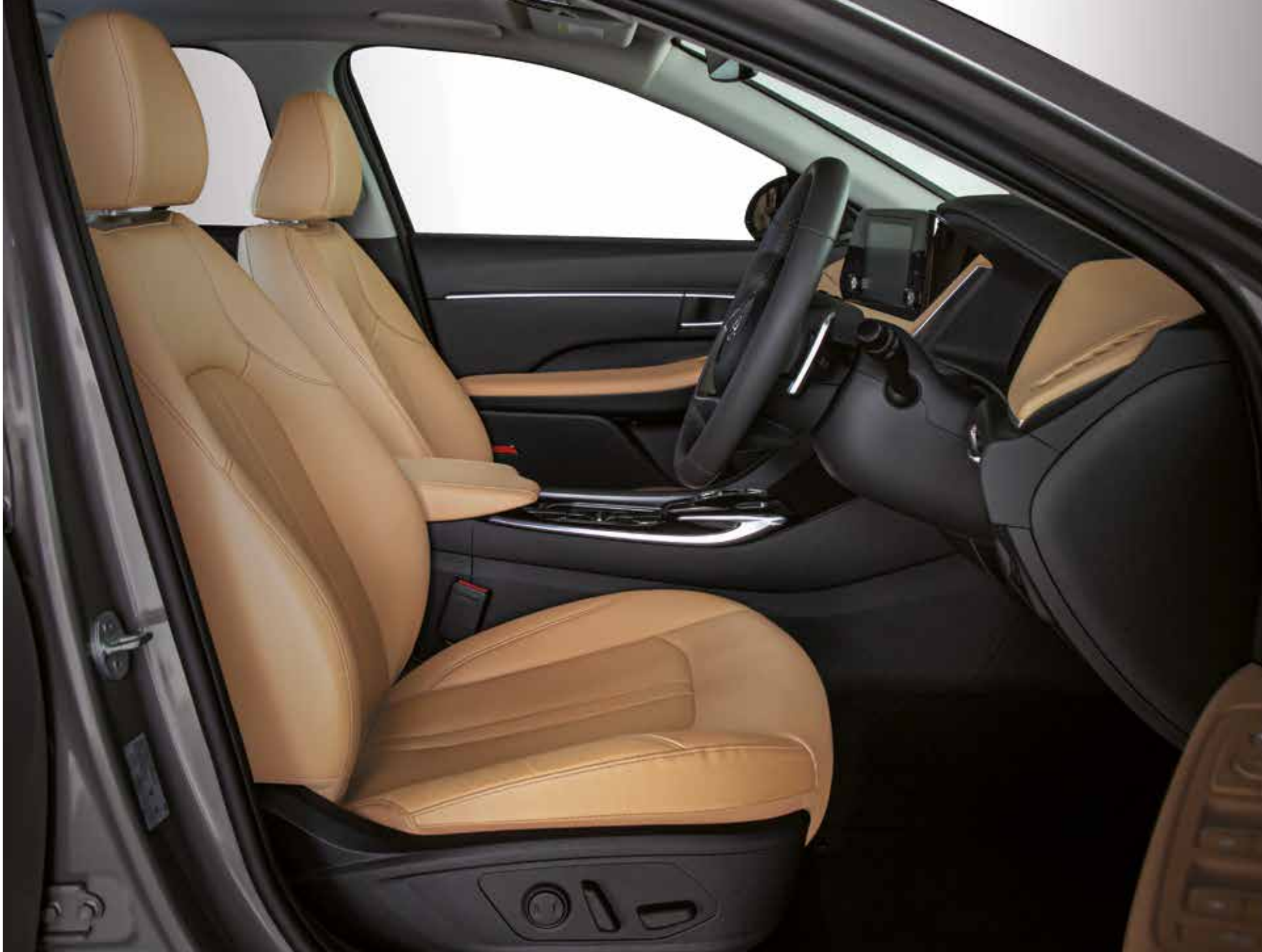
10-way powered driver seat with lumbar support