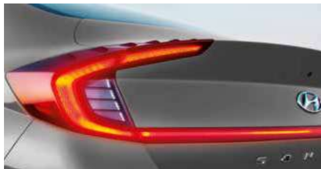
Horizontal LED rear combination tail lights