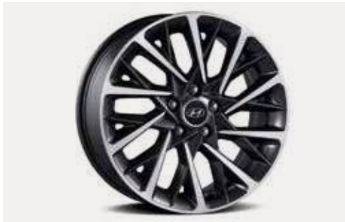
18" Alloy wheel