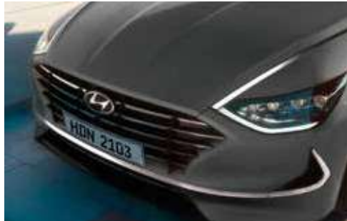
Black & Chrome coating radiator grille