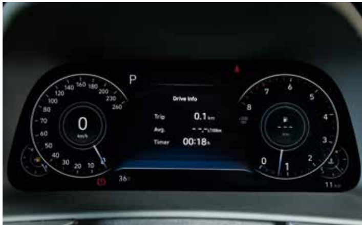
12.3" high resolution TFT LCD

Sonata flexes its muscles on command to keep you feeling confident and in charge of all driving situations. Whether cruising along the open highway or working through stop-and-go city traffic, there's a nimble yet dynamic quality that calms, relaxes and satisfies the driver. Steering is light yet precise and the ride is silky smooth. Premium appointments such as the head-up display and SuperVision gauge cluster further elevate driver's awareness and safety.