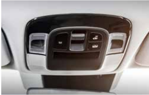
Front personal LED Lamps