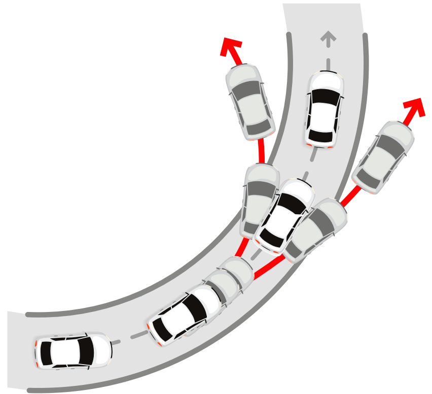
Electronic Stability Control (ESC) and Traction Control